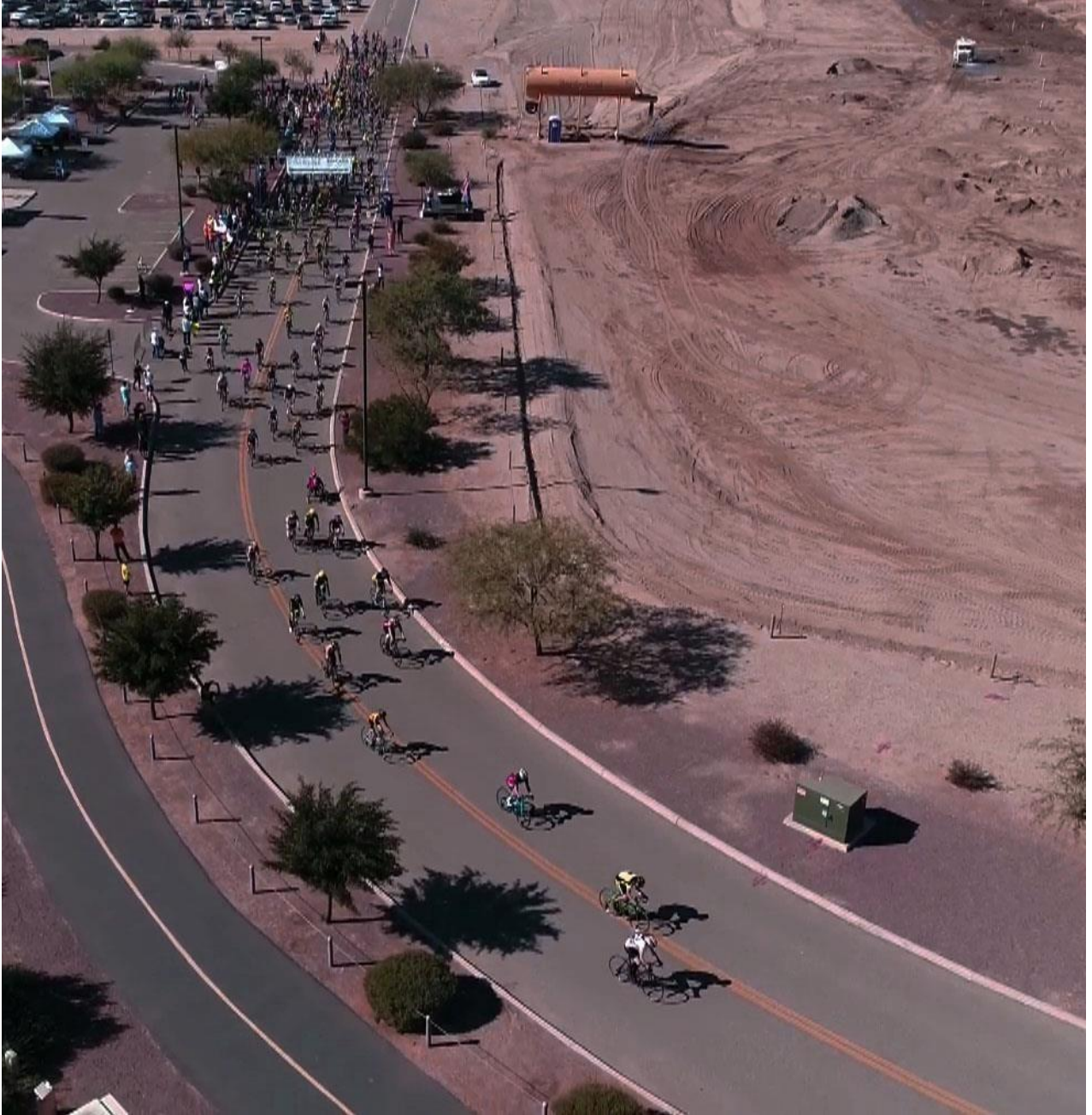
Start of 28

mile El Tour de Tucson 28 mile race 2017. Positions in picture: