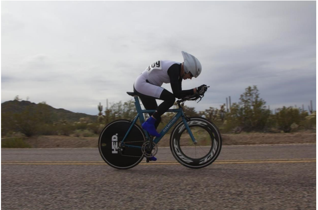
Me completing 20K Time Trial in January 2013

remembered the beautiful, one of kind, custom bike he had built specifically to fit him. Then I thought, “I can get exercise by riding a bike everywhere I need to go”. The next day I asked one of my professors who was an avid bike rider what would be a good beginner bike for me. Soon I found myself riding a blue Schwinn Le Tour everywhere I went; in rain or snow; day or night. On the weekends I found myself taking long tours on country roads. Once I asked a young woman whom I had been working with at the same practicum site for over a year for a date. I told her I would pick her up in my car. She didn’t believe I had a car because I had never drove it to work or school. In case you are wondering she had just gotten engaged, so she said no to the date.