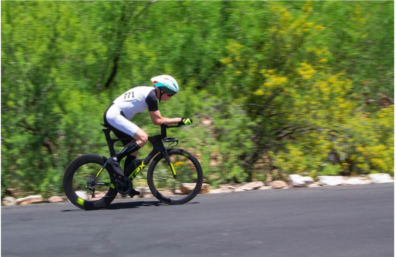
Me on day of time trial.