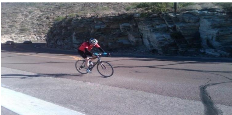
2011 Mount Lemmon, AZ Time Trial (10 miles at 5% average gradient)

For 2001 Lee and I knew we were marked men. Every time we lined up at races people would point and say something to the effect of, “watch those guys and stay on their wheel they are strong”. We trained even more intensely; starting some 6 months in advance. We bought a new lighter tandem by some 7 pounds and played with different gear arrangements. The appointed day arrived and I could not produce. I felt weak. We ended up 6 th overall and second tandem. It turns out I had bronchitis.