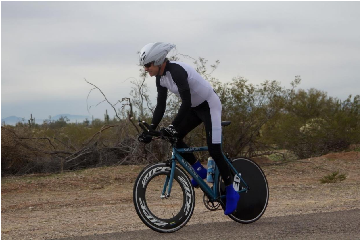
Me beginning a 12 mile time trial in 2013.

Then the official came to me. I was not amused to say the least, but I channeled my frustration into effort and caught the second place person on the way down the hill. The third place person was too far ahead to catch.