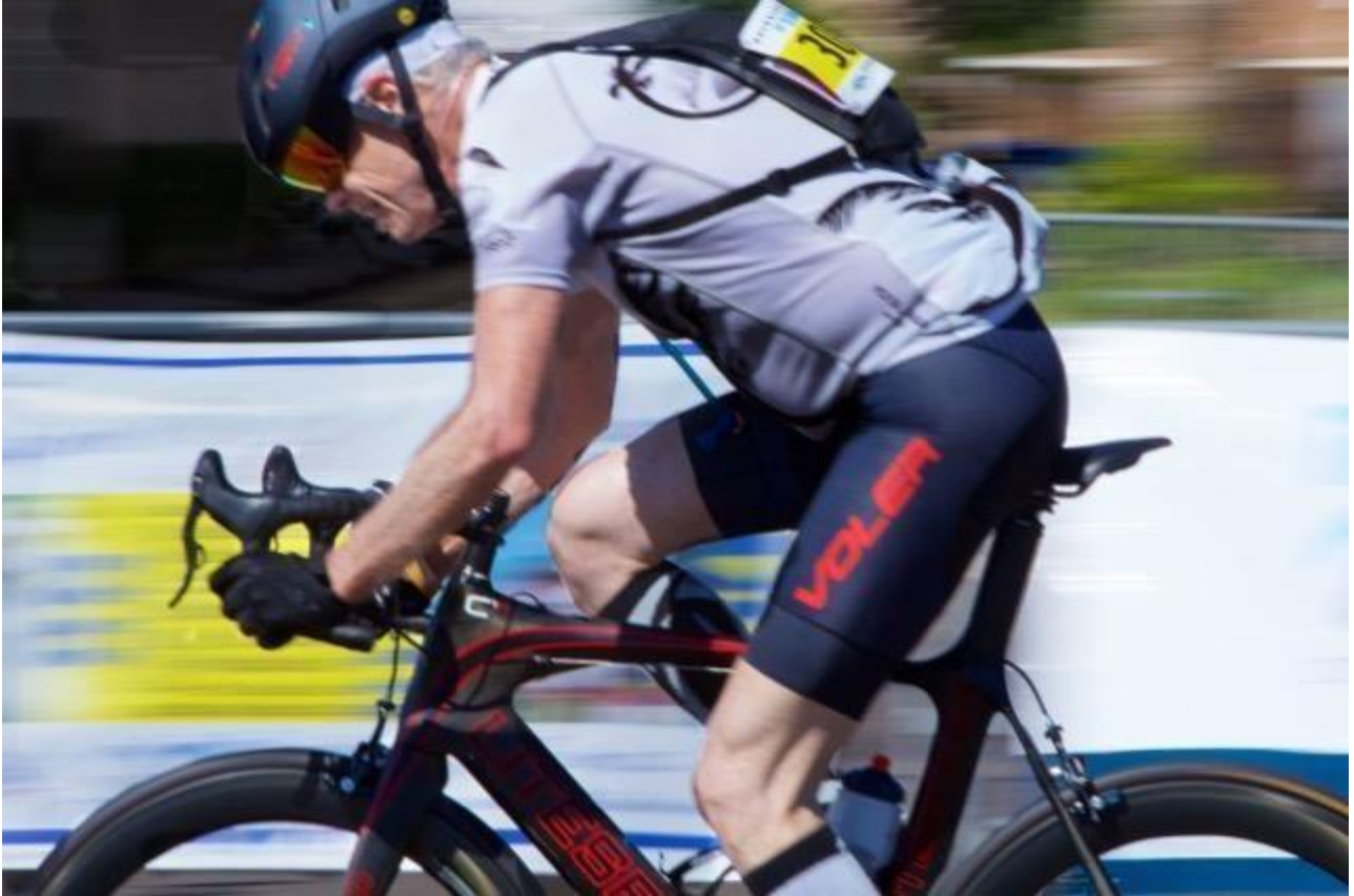
Me at the finish of the Tour De Mesa.