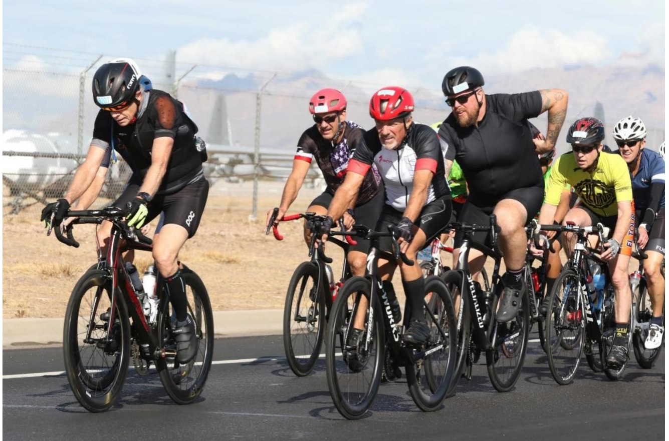
Me in first place in the lead pack of the 2023 el Tour de Tucson 32-mile race

In November 2023, I competed in the el Tour de Tucson 32 mile race and finished in 12 th place, even with body armor on. It was great fun. Noah Barker made a good showing in the 100-mile race and finished platinum.