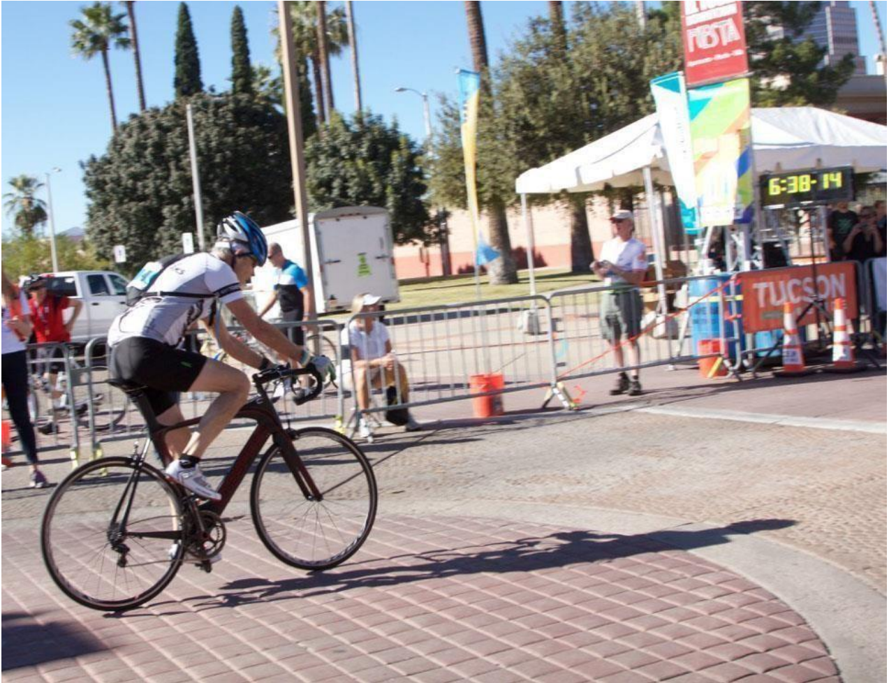
Me approaching the finish line in 6 th place at the 2015 El Tour De Tucson.