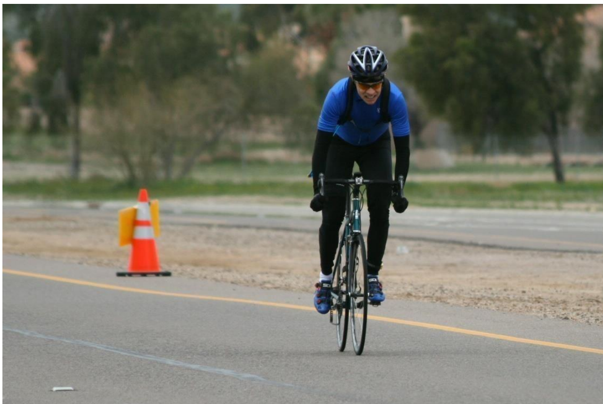
Me attempting to sprint at the finish of the 20 mile Arizona Senior Olympics 50 to 55 year old road race. I finished 4 th and did not qualify for nationals