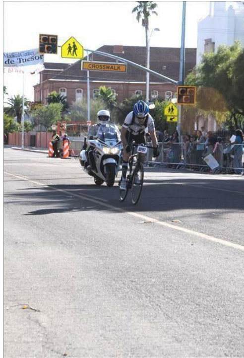
Me winning the 2016 El Tour de Tucson with my motorcycle escort.