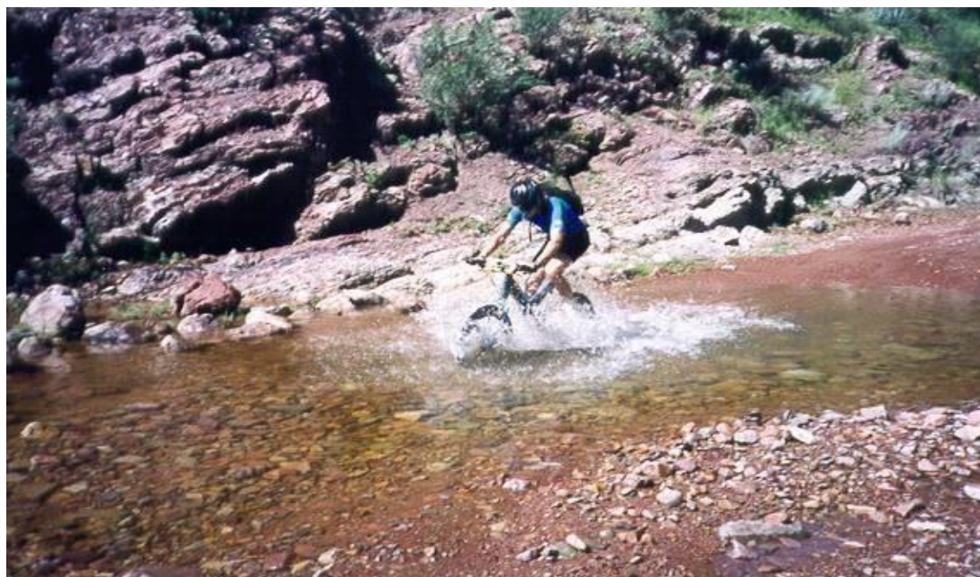
Me training on my mountain bike

smooth I could stay up with them, but when it was technical I was always left behind. I just didn't have the bike handling skills of the others. Some of them had been professional motocross racers and they had unmatched skills. I tried my had for a few years at mountain bike racing, but stopped competing due to getting tired of rehabbing from injuries.