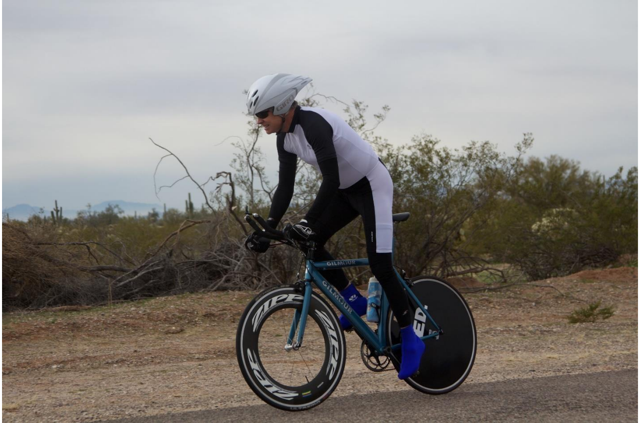
Me beginning a 12 mile time trial in 2013.

I lost a field sprint to the nice young man who had topped the climb in second place. Later I learned the race length had been reduced from 33 to 29 miles and I had covered 31.2 miles with my effort. My average speed was 21.7 MPH. I was declared the winner because I reached the top of the climb first and I was given the wrong information by the race official. Oh well!