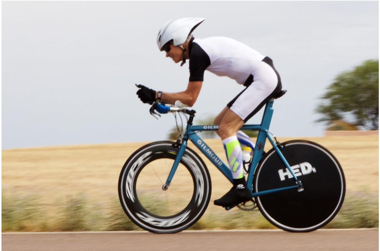
Me competing win the Sonoita to Patagonia Time Trial

been national champion in criterion racing and who will attempt to set the land speed record on a bicycle this fall by riding over 160 mph! A young man aged 13 came in third!