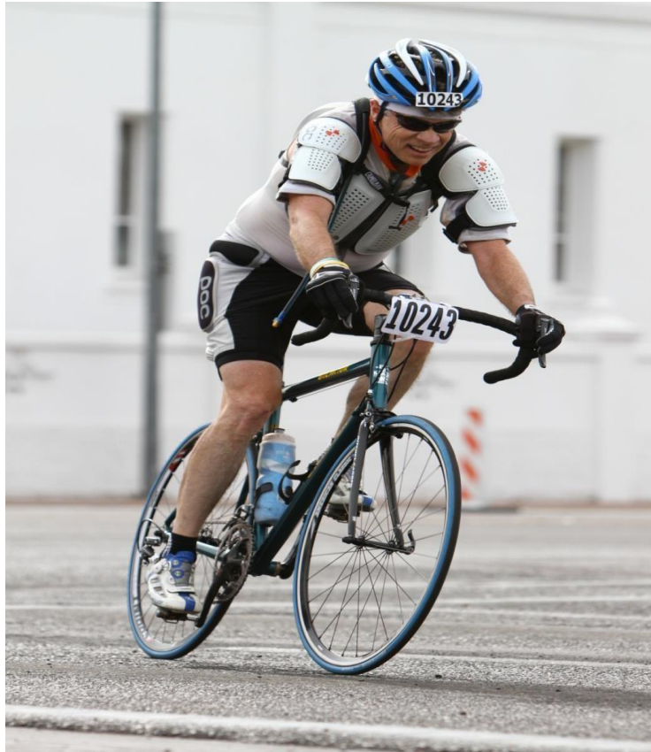
Me in 2012 El Tour de Tucson 42 mile race. I finished 8 th overall and 1 st rider over 50 years old to finish.

place overall and first person to finish who was over 50 years old (I was 55 at the time). There were over 1100 people who started the race and it was nice to know I still had some speed in my old legs.