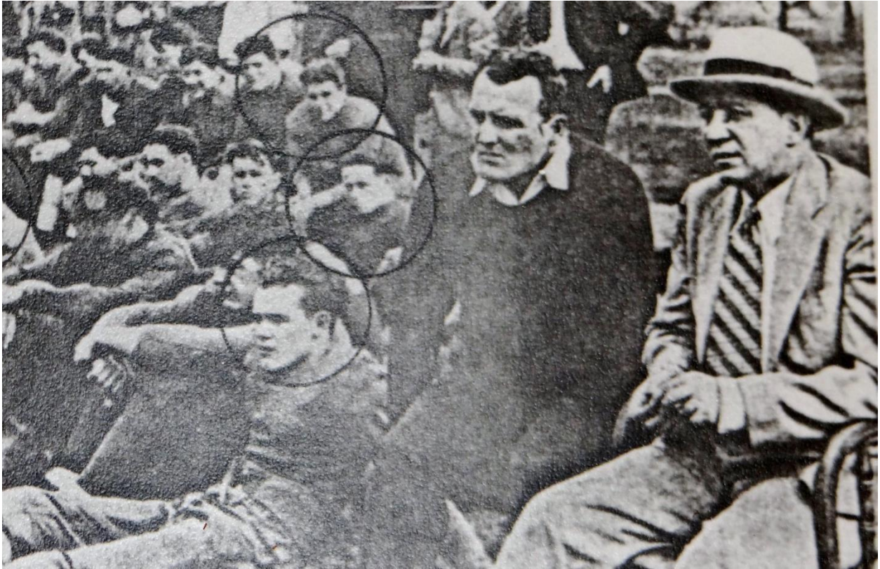
The Notre Dame 1930 National Championship Football Team:

Knute Rockne is the man on the right with the coat and tie. My father is the young man on the left inside the middle circle.