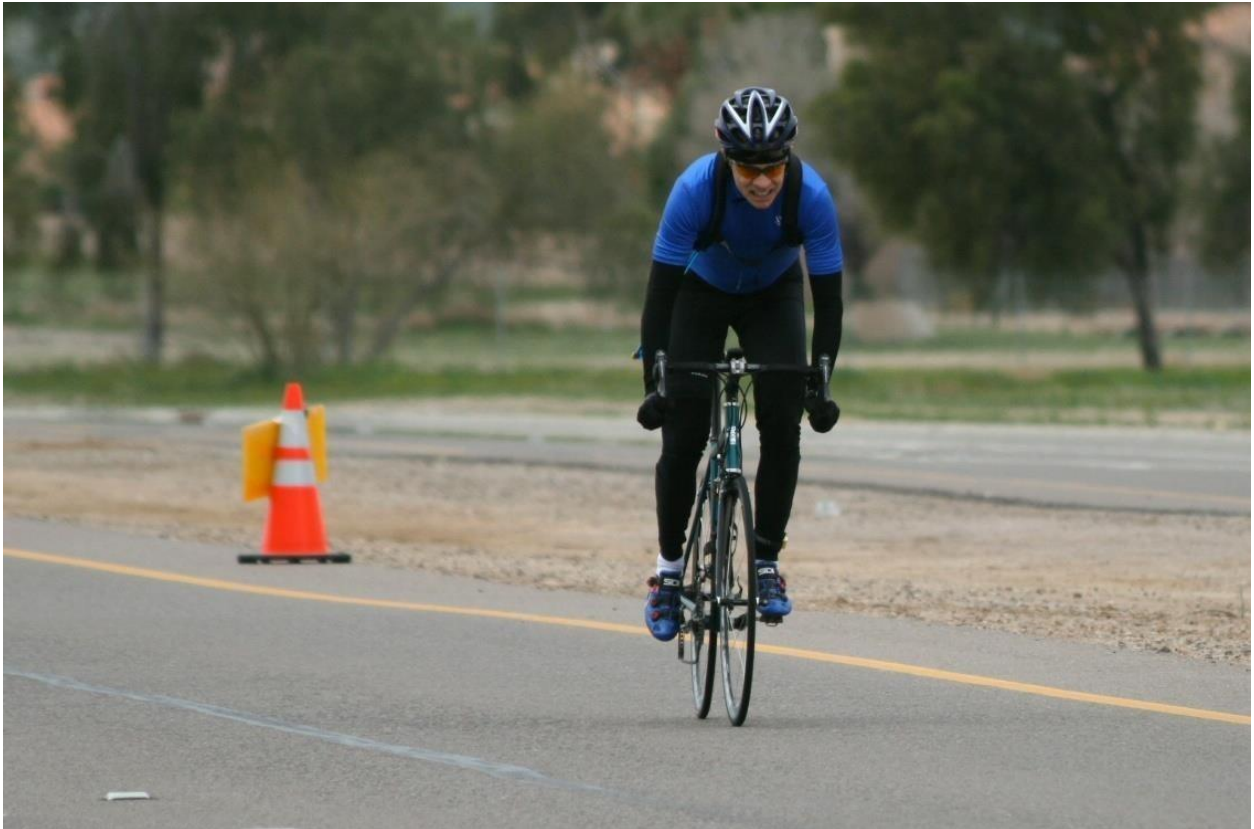
Me attempting to sprint at the finish of the 20 mile Arizona Senior Olympics 50 to 55 year old road race. I finished 4 th and did not qualify for nationals