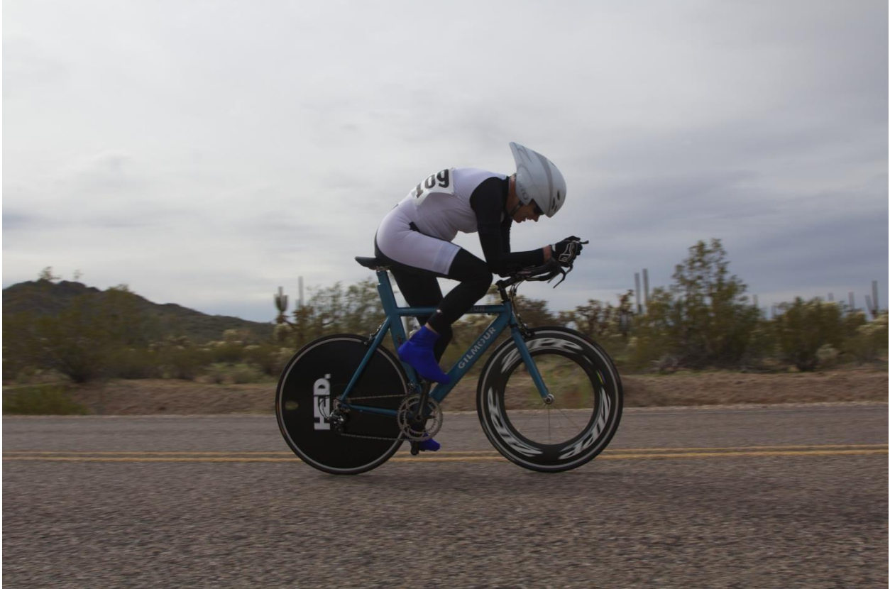
Me completing 20K Time Trial in January 2013

remembered the beautiful, one of kind, custom bike he had built specifically to fit him. Then I thought, “I can get exercise by riding a bike everywhere I need to go”. The next day I asked one of my professors who was an avid bike rider what would be a good beginner bike for me. Soon I found myself riding a blue Schwinn Le Tour everywhere I went; in rain or snow; day or night. On the weekends I found myself taking long tours on country roads. Once I asked a young woman whom I had been working with at the same practicum site for over a year for a date. I told her I would pick her up in my car. She didn’t believe I had a car because I had never drove it to work or school. In case you are wondering she had just gotten engaged, so she said no to the date.