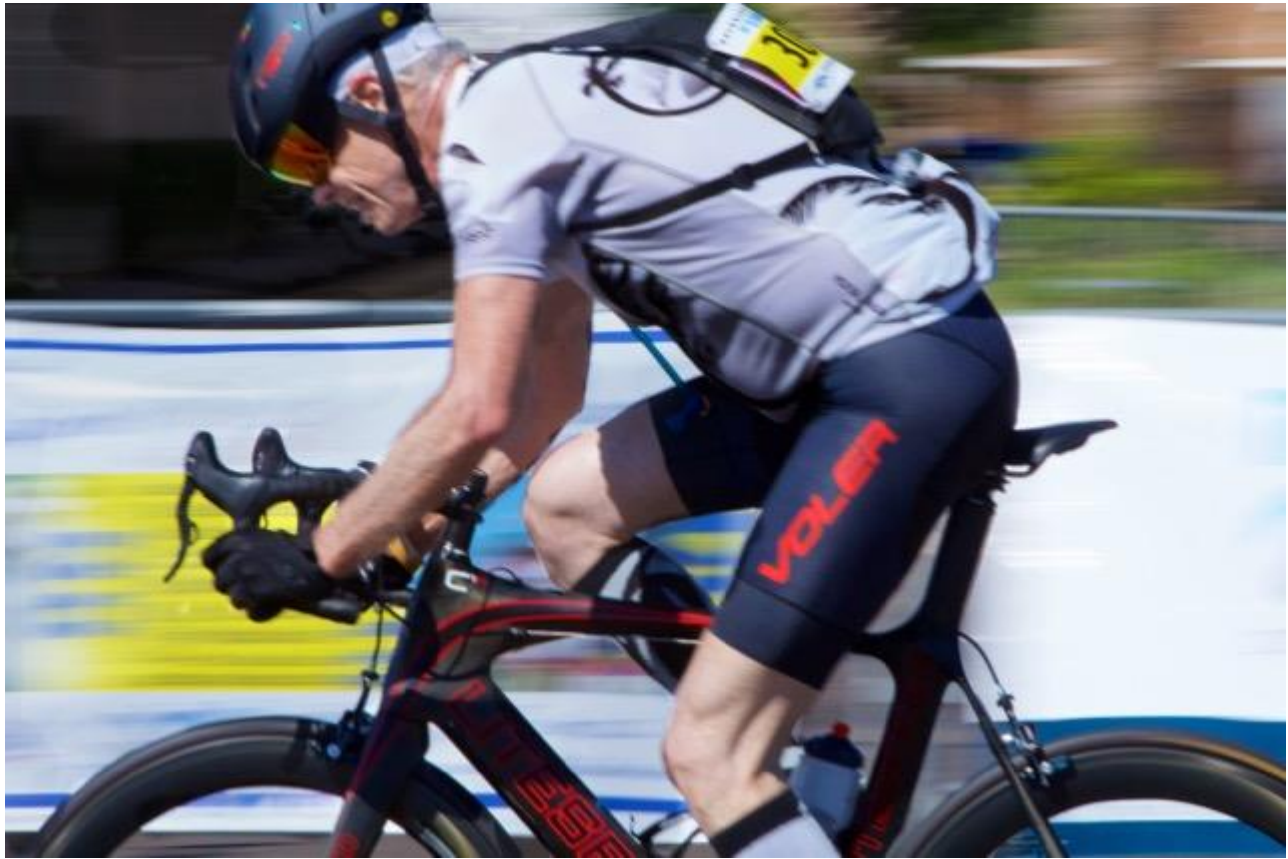
Me at the finish of the Tour De Mesa.

as of today it appears the PBAA will survive until November and the El Tour de Tucson.