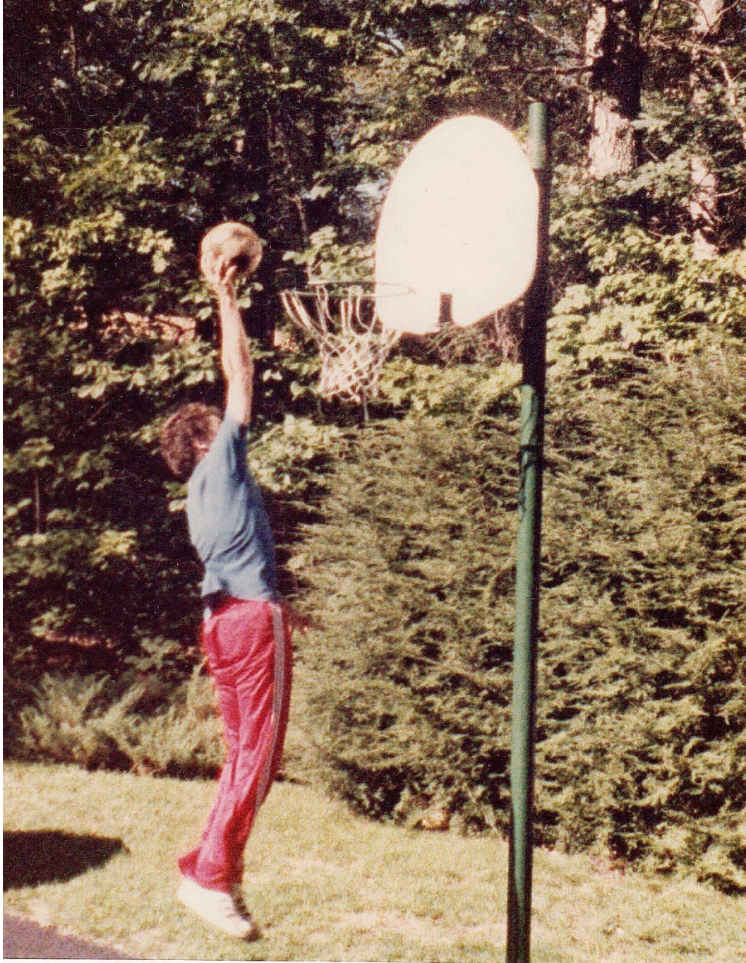
Yours truly dunking a flat soccer ball

After graduation from Norte Dame, I found myself a graduate student in Stillwater, Oklahoma living alone in an apartment on the edge of town five miles from campus. For six months I tried to find someone to play basketball with to no avail. Unfortunately, I also found I had little time to play due to my heavy graduate school schedule. I found I was getting grouchy, anxious and somewhat depressed. My fitness level also decreased significantly.