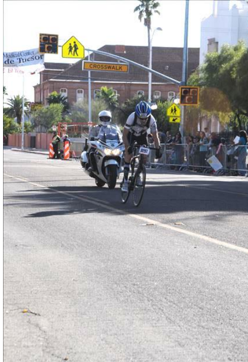
Me winning the 2016 El Tour de Tucson with my motorcycle escort.

2017 Started out with a fizzle. My first event was the 12 K Flapjack time trial in Pichaco, Arizona. I finished 6 th out of 7 in my age group (60 to 65; yes I have moved up!). My time was 33 minutes 40 seconds with an average speed of 22.83 MPH. For some reason I cannot break the 23 MPH barrier.