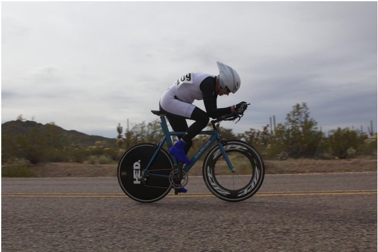
Me completing 20K Time Trial in January 2013

All of this weighed on my mind and then one day I was thinking about a former college roommate who had been bicycle racing champion of his home state for two years prior to college and who competed in college. I remembered the beautiful, one of kind, custom bike he had built specifically to fit him. Then I thought, "I can get exercise by riding a bike everywhere I need to go". The next day I asked one of my professors who was an avid bike rider what would be a good beginner bike for me. Soon I found myself riding a blue Schwinn Le Tour everywhere I went; in rain or snow; day or night. On the weekends I found myself taking long tours on country roads. Once I asked a young woman whom I had been working with at the same practicum site for over a year for a date. I told her I would pick her up in my car. She didn't believe I had a car because I had never drove it to work or school. In case you are wondering she had just gotten engaged, so she said no to the date.