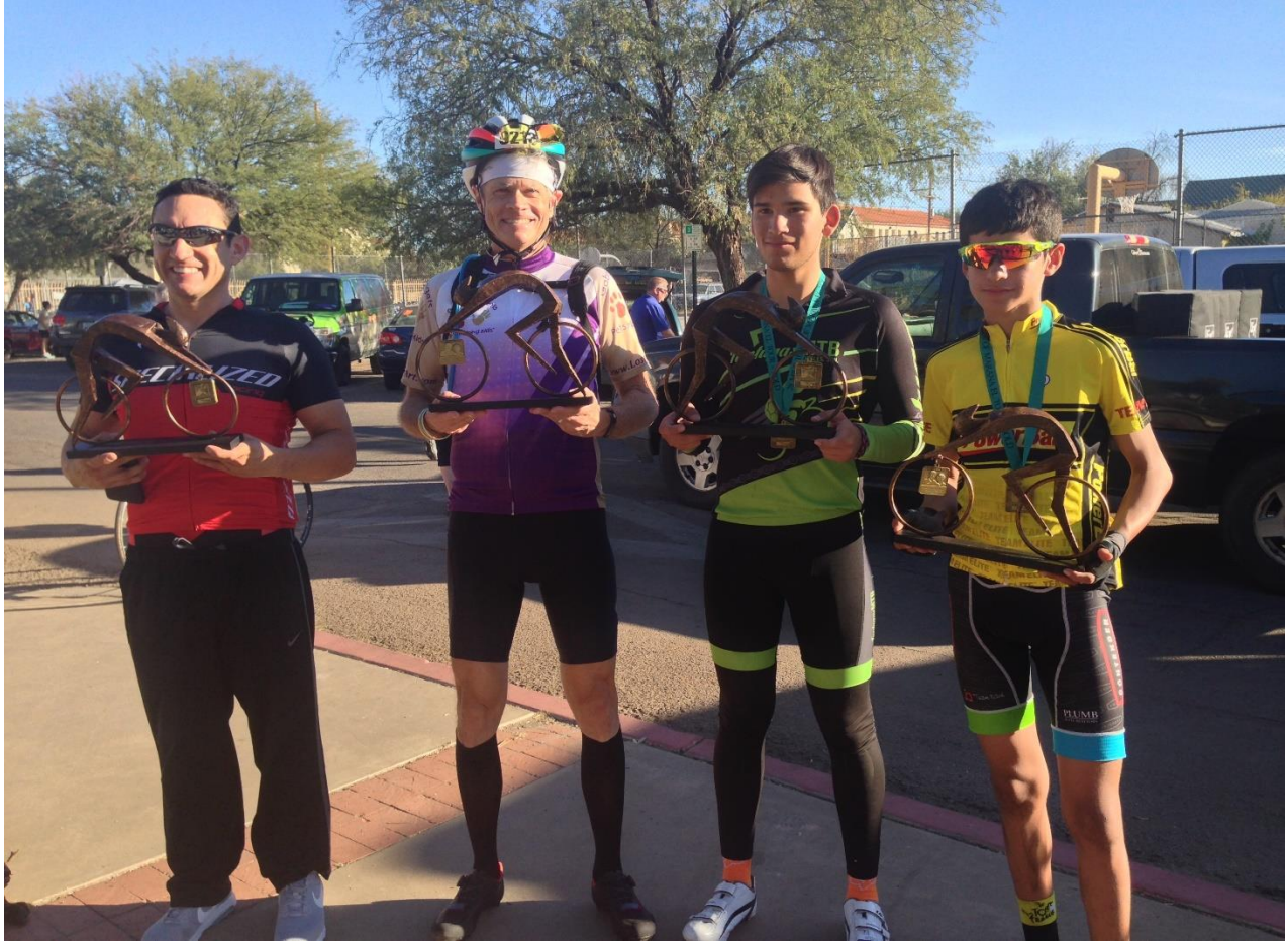
The Four 2017 28 mile El Tour de Tucson Champions