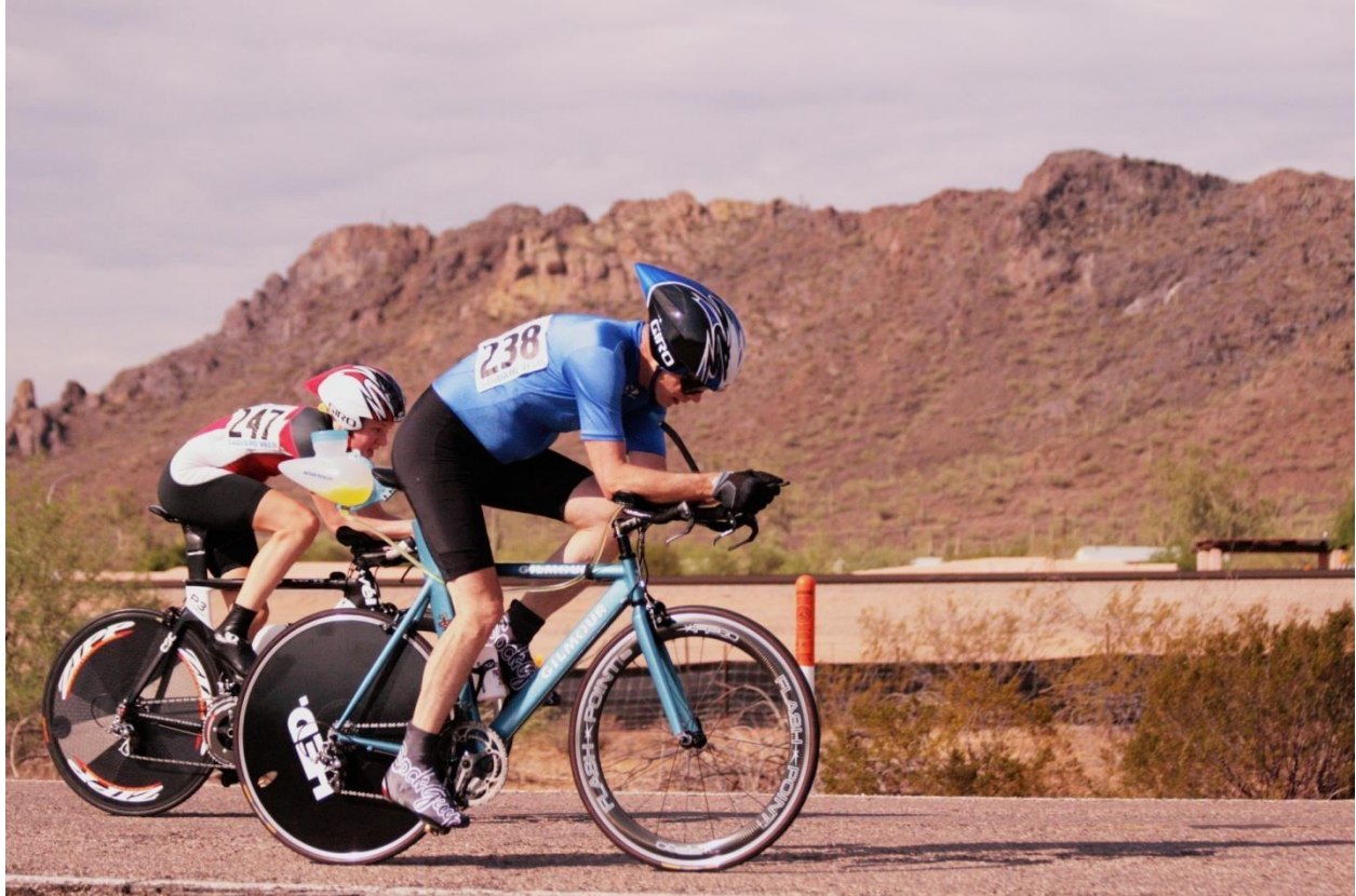
Me Completing 20K Time trial in 2008

A shortly after starting mountain bike racing I started road bike racing and really excelled at it as well as enjoyed it immensely. The first road bike race I competed in was the 1993 El Tour de Tucson 50 mile race. All my mountain bike racing buddies were shocked how strong I was. I cracked in the last 8 miles of the race due to a lack of knowing how much to eat and drink in such racing as well as how to pace myself. However, I ended up 16 th in the race and from then on I was hooked.