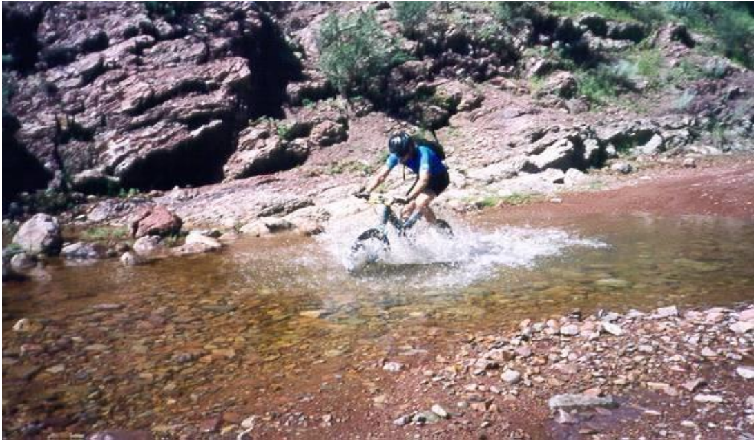
Me training on my mountain bike

rack on it. Would you like to go for a ride sometime?" Soon I was riding with him and several other people all of who were competitive mountain bike racers. I bought a mountain bike and found when the trail was flat and smooth I could stay up with them, but when it was technical I was always left behind. I just didn't have the bike handling skills of the others. Some of them had been professional motocross racers and they had unmatched skills. I tried my had for a few years at mountain bike racing, but stopped competing due to getting tired of rehabbing from injuries.