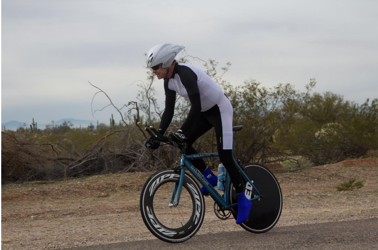
Me beginning a 12 mile time trial in 2013.

I lost a field sprint to the nice young man who had topped the climb in second place. Later I learned the race length had been reduced from 33 to 29 miles and I had covered 31.2 miles with my effort. My average speed was 21.7 MPH. I was declared the winner because I reached the top of the climb first and I was given the wrong information by the race official. Oh well!