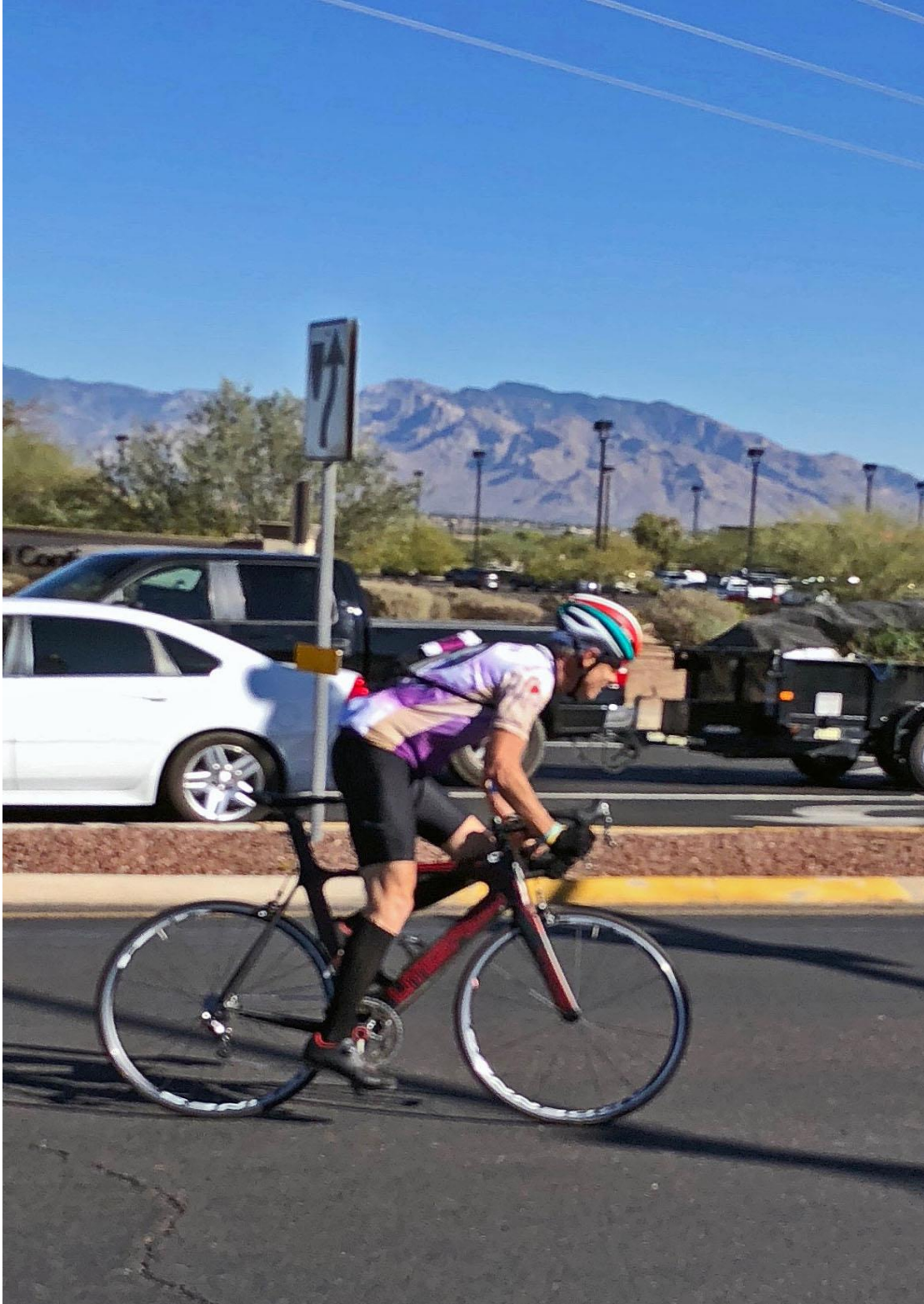
Picture Taken by Jackie Theodorakis at Twin Peaks and Silverbell of me at the 2017 28 mile El Tour de Tucson