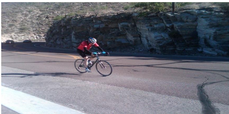
2011 Mount Lemmon, AZ Time Trial (10 miles at 5% average gradient)

For 2001 Lee and I knew we were marked men. Every time we lined up at races people would point and say something to the effect of, “watch those guys and stay on their wheel they are strong”. We trained even more intensely; starting some 6 months in advance. We bought a new lighter tandem by some 7 pounds and played with different gear arrangements. The appointed day arrived and I could not produce. I felt weak. We ended up 6 th overall and second tandem. It turns out I had bronchitis.