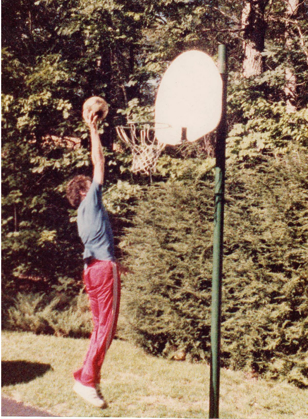
Yours truly dunking a flat soccer ball

After graduation from Norte Dame, I found myself a graduate student in Stillwater, Oklahoma living alone in an apartment on the edge of town five miles from campus. For six months I tried to find someone to play basketball with to no avail. Unfortunately, I also found I had little time to play due to my heavy graduate school schedule. I found I was getting grouchy, anxious and somewhat depressed. My fitness level also decreased significantly.