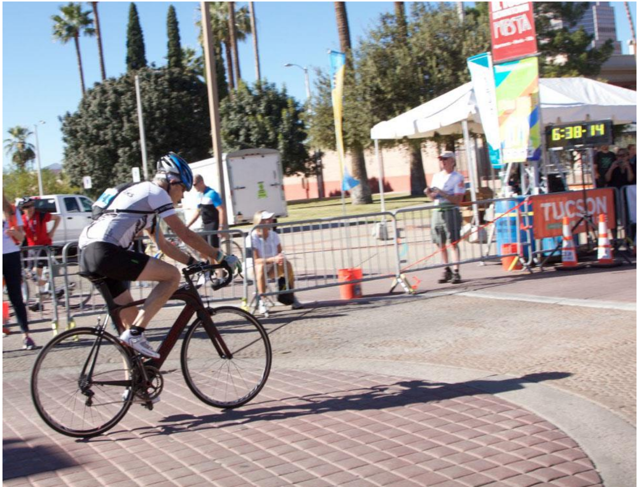
Me approaching the finish line in 6 th place at the 2015 El Tour De Tucson.

exercise (Ratey, 2008). Often for those with clinically significant depression and anxiety more is needed like cognitive behavioral therapy and psychotropic medication (Ratey, 2008). However, a regular regimen of aerobic exercise can lift mood, improve cardiovascular health and fitness among other things (Ratey, 2008).