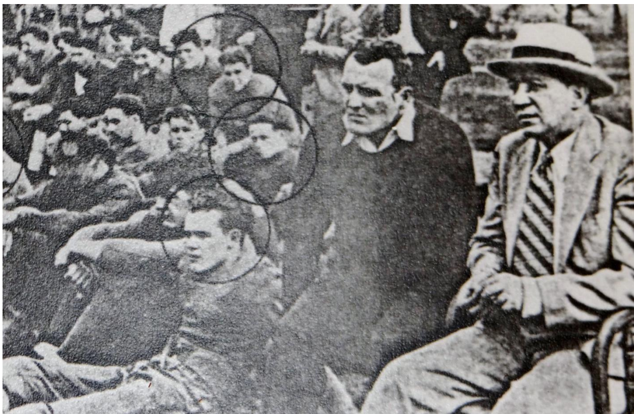
The Notre Dame 1930 National Championship Football Team:

Knute Rockne is the man on the right with the coat and tie. My father is the young man on the left inside the middle circle.